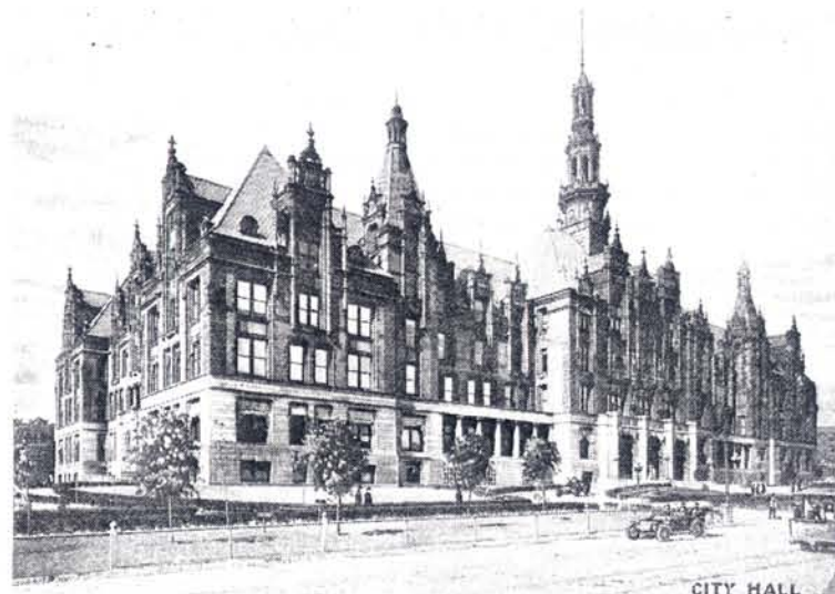
City Hall in 1911 shows the towers that were removed in 1936.

Despite its incomplete state, City Hall was praised for its "splendid architectural composition," and called "an impressive period piece of craftsmanship."