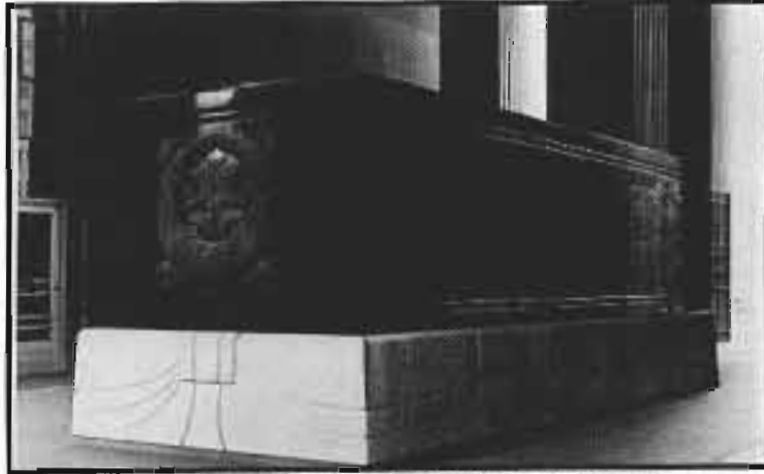
The Cenotaph in the center of the loggia is of black granite and has the names of 1075 St. Louisans who sacrificed their lives in World War I carved upon it. Above each entranceway to the museum rooms is a caricature of St. Louis IX, the City's patron saint.