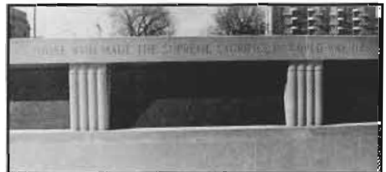
Annual patriotic and colorful flag ceremonies sponsored by St. Louis Veteran organizations are staged on the steps of Soldiers' Memorial on most holidays such as Memorial Day, Fourth of July, and Veterans Day. The public is invited to attend; information may be obtained by contacting Soldiers' Memorial Military Museum.