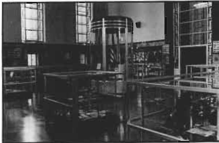
Two museum rooms contain a collection of military items ---- firearms, edged weapons, memorabilia, flags, posters and medals depicting St. Louis' patriotic and active military involvement from 1800 through the present. Life size mannequins exhibit women's and men's uniforms, insignia and equipment.

Museum hosts traveling exhibits periodically.