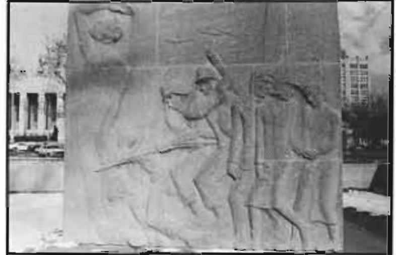
Across Chestnut Street is located the Court of Honor, an area dedicated on Memorial Day 1948 to those who lost their lives in World War II. Listed on the red granite tablets are 2,753 names of St. Louis citizens who died in this conflict. On each end of the landscaped area stand two monuments, dedicated in 1979, to honor the 161 St. Louisans who lost their lives in Korea and the 214 who lost their lives in Vietnam.